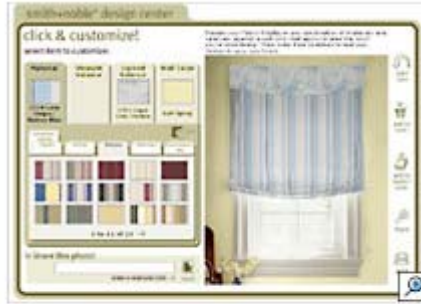
Custom window treatment designer for Smith + Noble DEMO >

Smith & Noble provides a custom window treatment designer for its customers, tying directly to its pricing database to give customers an exact price. Customers can visually choose from a large variety of window treatment types (blinds, shades, panels, wovens, fabrics) and hundreds of options (materials, valances, trim), including wall and trim paint colors.