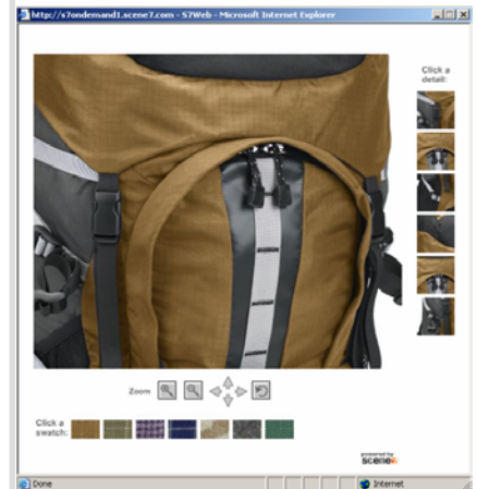
Swatch & Zoom Viewing

Streamline image production and publishing