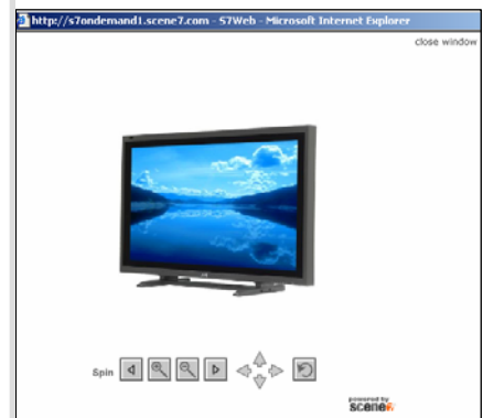
Spin Set Viewing